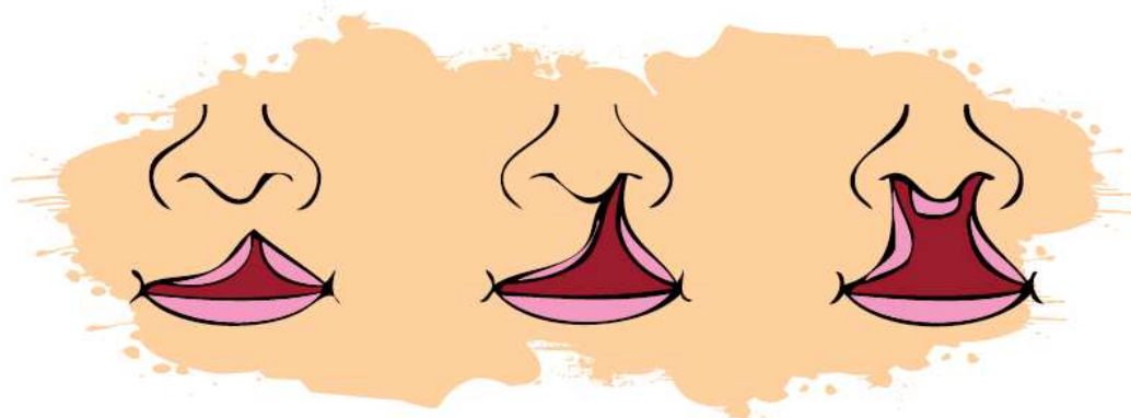
Unilateral incomplete cleft